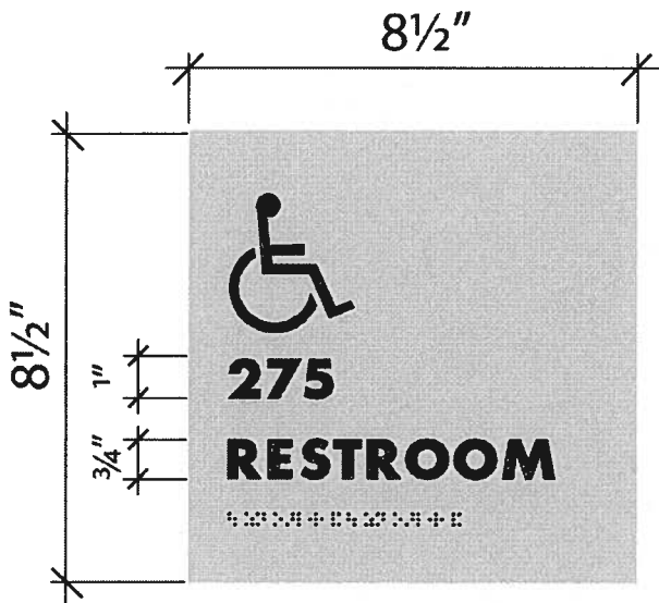
Restroom Room Sign